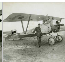
Up Up and Away